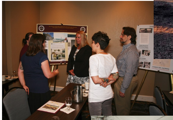
Poster session discussions

Presentations from the Annual Meeting can be viewed at http://florida-archivists.org/2014-annual-meeting-presentations/